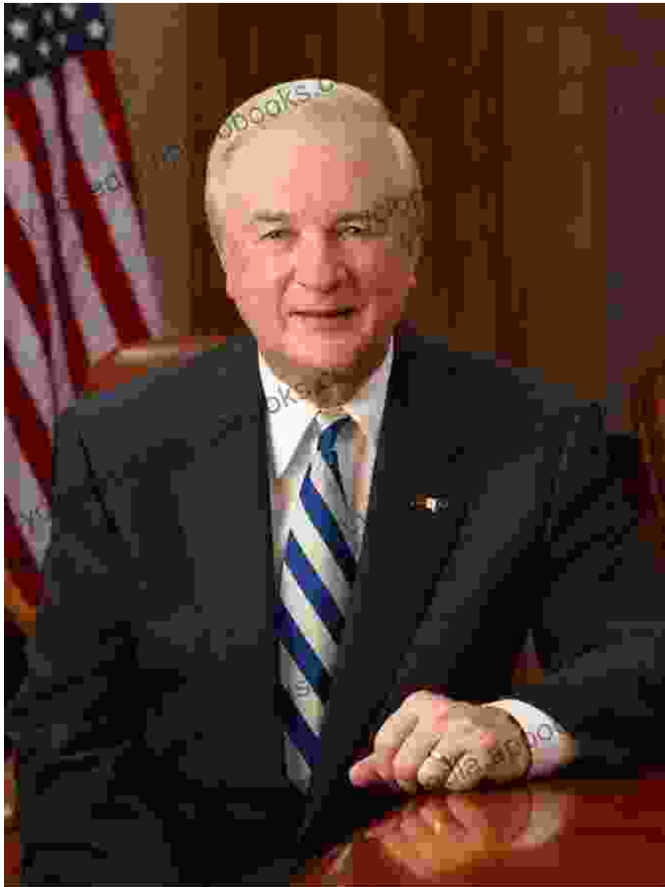
Jim Hunt, a rising Democratic star.

Helms's conservative ideology. He promised to bring new jobs and economic prosperity to the state, while also advocating for social progress.