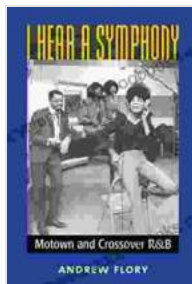
Image 3: Max, a young composer, his eyes closed as he immerses himself in the creation of his masterpiece. * Image 4: The book cover of "Hear Symphony," featuring a vibrant swirl of musical notes that evoke the novel's enchanting melody.