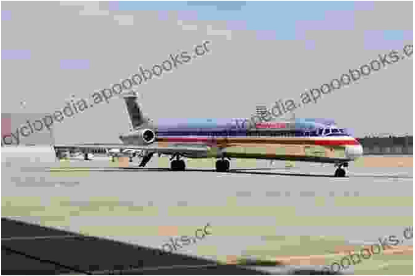
McDonnell Douglas MD-80 jetliner