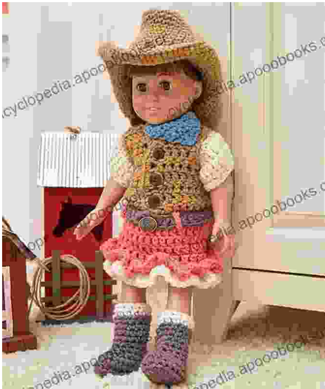
Crochet Pattern-CP369-10"-12" and 14"-16" doll outfit- USA Terminology by Maria Grazia Swan